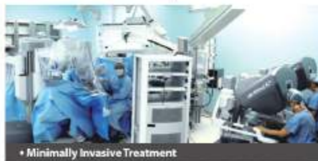
• Minimally Invasive Treatment

The institute is organized into the Cardiac Center, Stroke Center, Vascular Center, Imaging Center, and Rehabilitation Center. We moved away from the traditional department model, instead creating an integrated system that brings together internal medicine, general surgery, radiology, intensive care, and pediatrics.