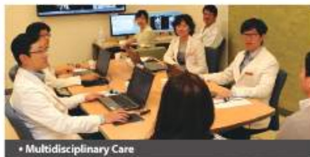
• Multidisciplinary Care

The Center, which is specialized in cancer treatment, was opened in January 2008 with 11 floors aboveground and 8 underground floors as well as 700 beds. Here, the top-level medical team in Asia provides highest-quality medical treatment and services.